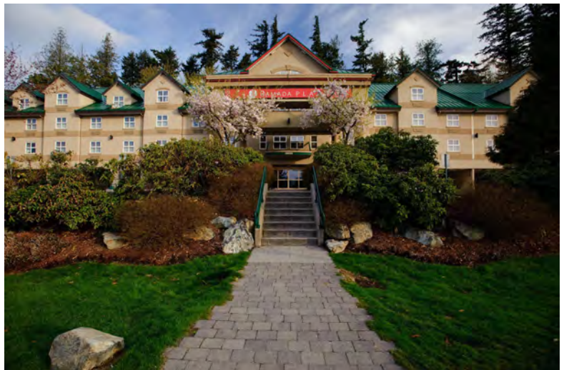
Ramada Plaza Abbotsford Hotel and Conference Centre