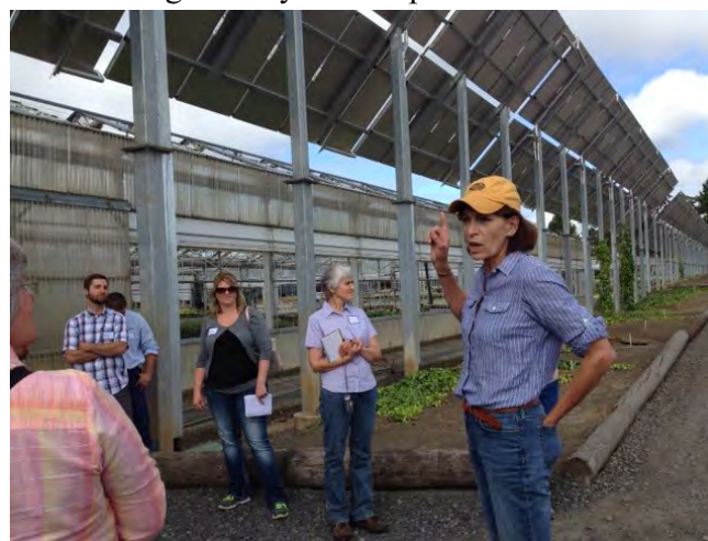
Solar water panels at Blooming Nursery.

automation. We began the tour with short videos demonstrating the specialty equipment that they use, including specialized trimming machines, fertilizer applicators and field digging machines. Gold Hill Nursery then toured us through their propagation and liner greenhouses, as well as demonstrated their Da Ros transplanting machine.