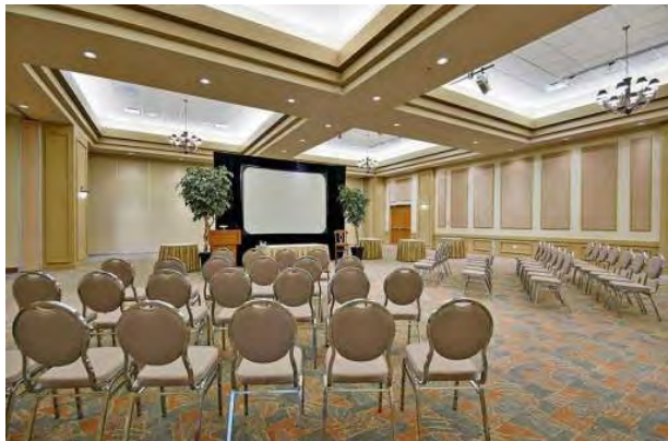
One of the Ramada Plaza's meeting rooms.

Friday and Saturday will be filled with practical speakers on IPM, media and compost, trade,