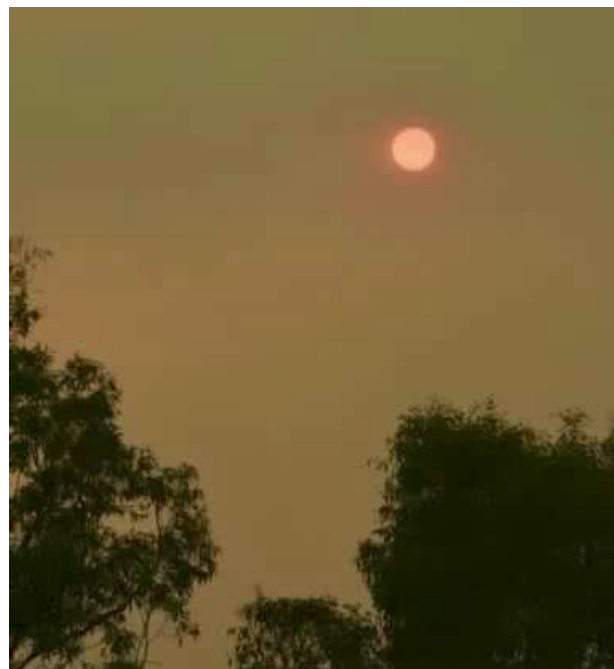
Smoke obscuring the red sun over Sydney area